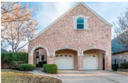
4675 San Marcos Way 4 BD 5 BA 3718 SF $439,000