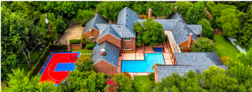
10131 Hollow Way Road 5 BD 8 BA 7235 SF $2,850,000

Here is a snapshot of our top sales in DFW.