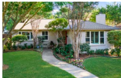
6264 Sudbury Drive 2 BD 2 BA 1518 SF $450,000